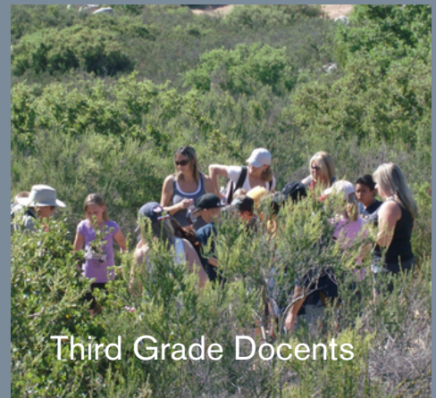
Third Grade Docents