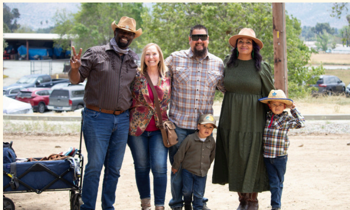
VISITORS AT THE 45TH ANNUAL WILD WEST FESTIVAL AT GILMAN SPRINGS

As we get closer into summer, we have a whole lineup of events and camps to engage Riverside County residents