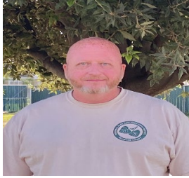
Employee of the Month