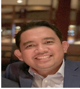
Employee of the Month