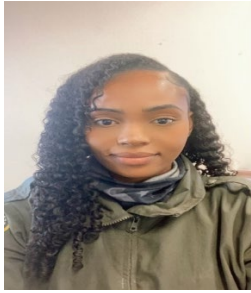
Employee of the Month