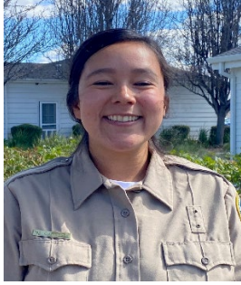
Employee of the Month